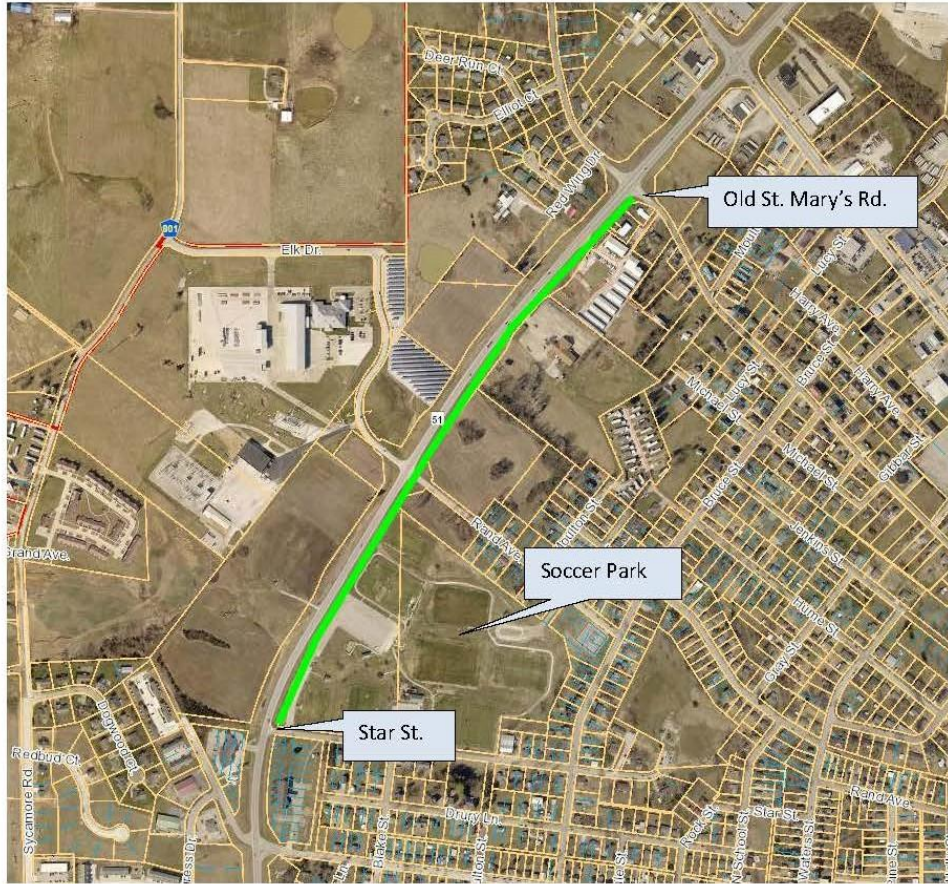
Exhibit A - Location of Project